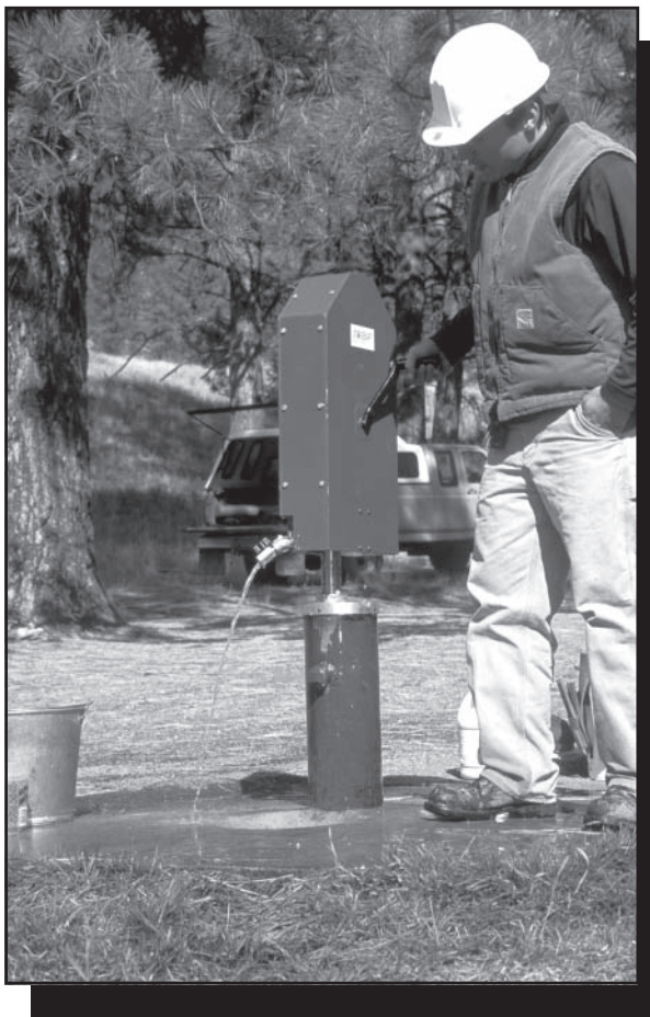
Figure 1—The first Forest Service accessible handpump was installed on the Lolo National Forest in the fall of 2002.

MTDC designed and built an accessible handpump that meets ADA requirements. It operates with no more than 5 pounds of force (figure 2) and its handle is easy to reach and operate from a wheelchair.