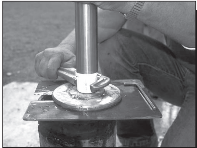
Figure 3—The accessible handpump is easily installed on standard well casings.

The pump's handle has been approved for use with a closed fist. A demonstration of the pump in use can be viewed at the T&D Internet site: http://www.fs.fed.us/t-d/programs/eng/handpump.htm (username: t-d, password: t-d).