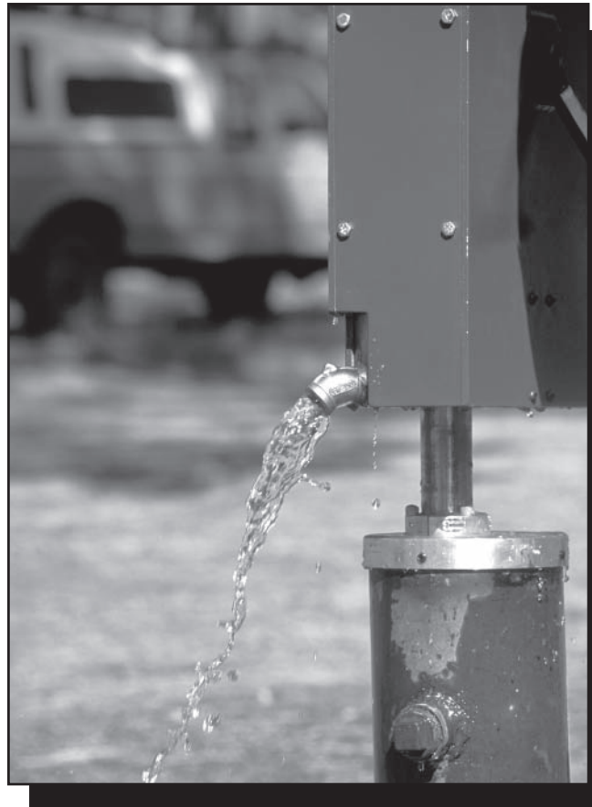
Figure 4—Water flows an average of 1.5 gallons per minute.