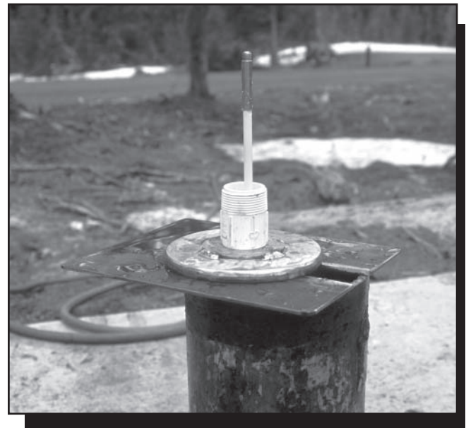
Figure 2—Lightweight fiberglass pump sucker rods help the accessible handpump meet the 5-pound maximum force requirement of the Americans With Disabilities Act.